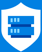
Infrastructure & Network Security

Our security platform provides comprehensive security features that are constantly evolving in order to respond to, and help mitigate, potential threats. The platform capabilities and the technologies it employs are regularly examined and reviewed by our security team to help ensure an extremely secure communications and collaboration experience that can be trusted to protect you and your businesses.